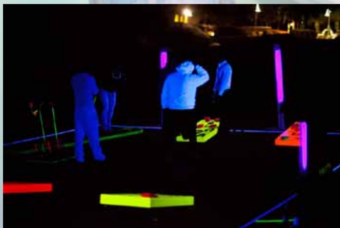
Glow-in-the Dark bean bags on the beach