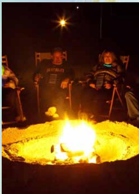
Staying nice and warm by the bonfire on the beach