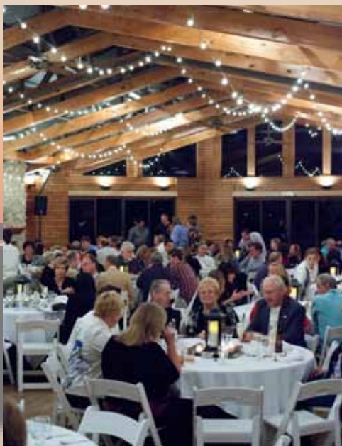
One of the many groups that enjoyed dinner under the lights at Walker's Landing