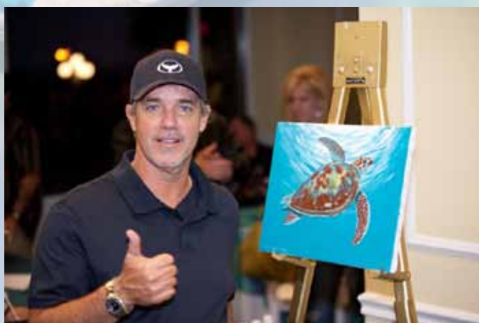
Wyland's canvas waiting to be auctioned off