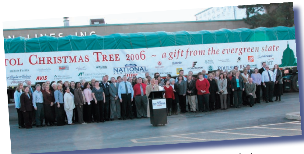
National Van Lines employees get a photo opportunity with the tree.

On Wednesday, November 22nd, the tree arrived in Broadview Illinois, where National Van Lines employees and honored guests greeted the caravan.