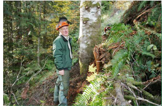
The tree was cut in the Olympic National Forest on November 1st.