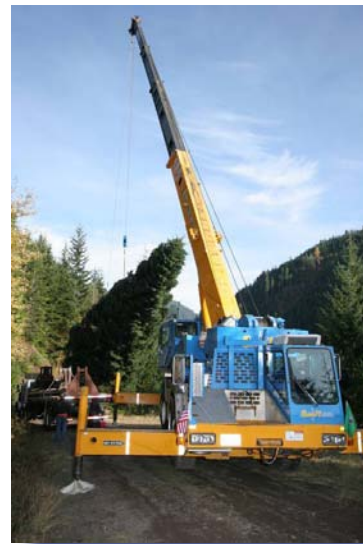
The cut tree was supported by crane and then transferred to the flat bed trailer.