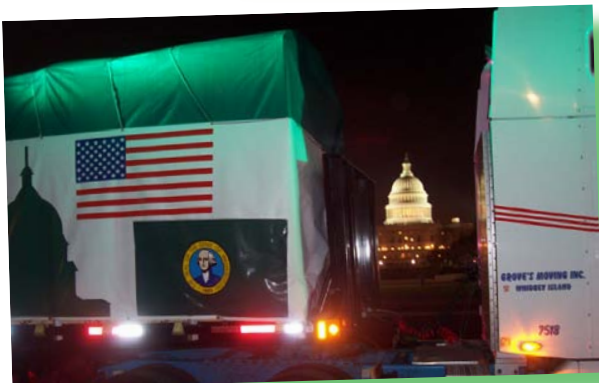
The tree arrives at the Capitol lawn before daybreak.