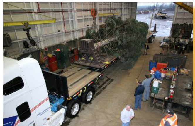
Here the additional span was added to the trailer.