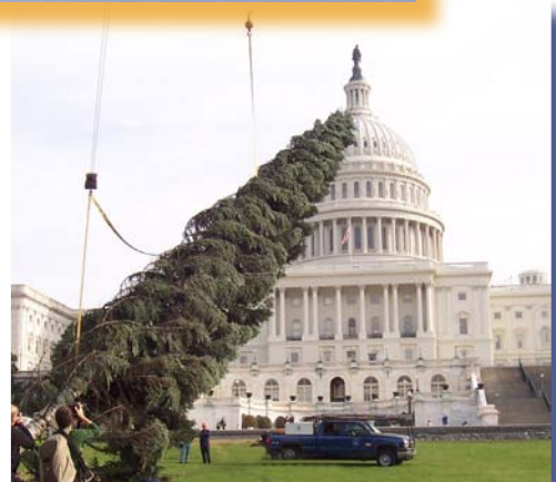
The 65' Pacific Silver Fir being set up on the west lawn.