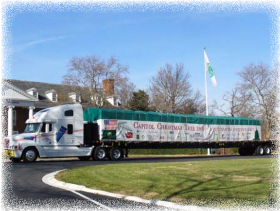
The last stop before entering DC was the 4-H Center in Chevy Chase, Maryland.