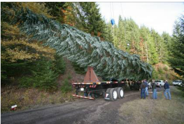
Until we could get the tree down the mountain, the flat bed was not extended full length.