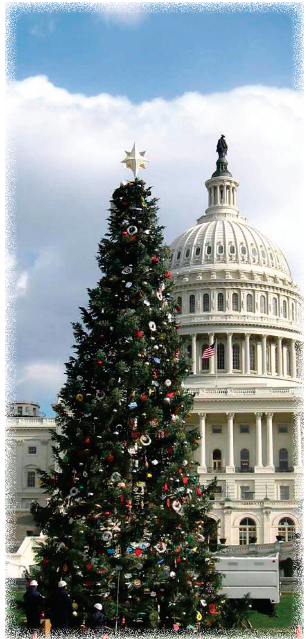
Twilight - just before the lighting ceremony.