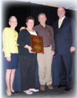
25 YEARS A-Plus Van & Storage Company Norfolk, Virginia