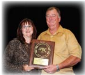
Administrative Excellence 2007 – 1 st Place Lone Star Van Lines