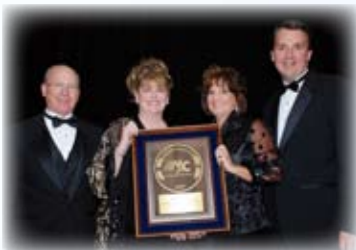
First Place Customer Service Award Piedmont Van & Storage