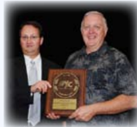
Claim Prevention 2007 – 1 st Place Southern Cal Moving & Storage