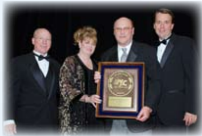
2006 McCarthy Transfer