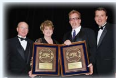
2006 & 2007 Sav-On Moving & Storage