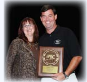
Administrative Excellence 2006 – 3 rd Place Trading Post