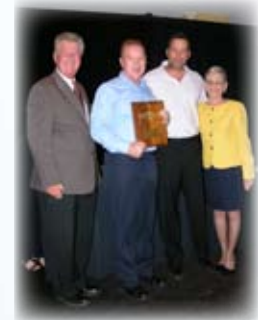
15 YEARS Zorn Moving & Storage San Jose, California