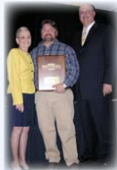
25 YEARS Active Moving & Storage Pensacola, Florida