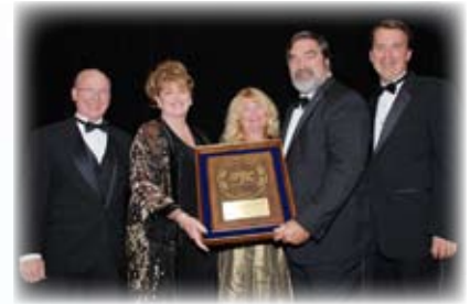
2006 Hammock Transfer