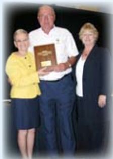
10 YEARS Action Moving & Storage Rockford, Illinois