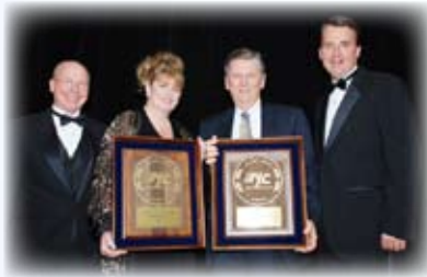
2006 & 2007 A- Plus Van & Storage