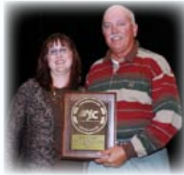
Administrative Excellence 2006 – 2 nd Place Greinke Moving & Storage