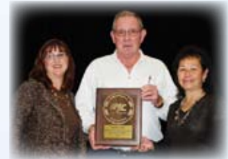
Administrative Excellence 2007 – 3 rd Place Britannia Moving & Storage