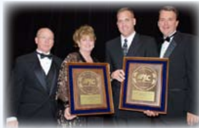
2006 & 2007 Quality Services Moving