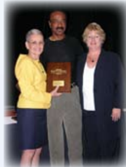
15 YEARS Taylor Transfer Decatur, Illinois