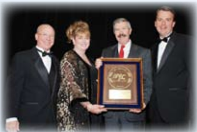
2006 Moore & Moore Moving & Storage