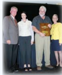
25 YEARS Belfor Moving Novato, California