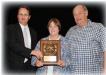
Claim Prevention 2006 – 1 st Place Hill Moving Services