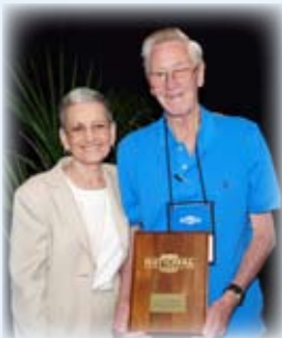
15 YEARS King Moving & Storage Valdosta, Georgia