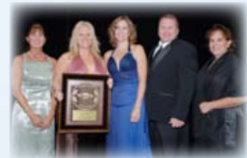
International Commercial Sales Joe Bonnie & Son