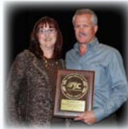
Administrative Excellence 2007 – 2 nd Place Shur-Way Moving & Storage