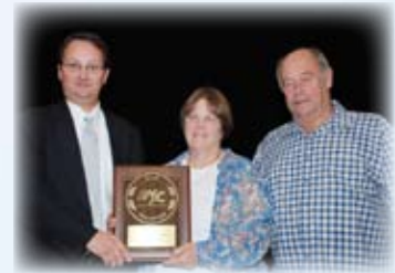
Claim Prevention 2007 – 3 rd Place Hill Moving Services