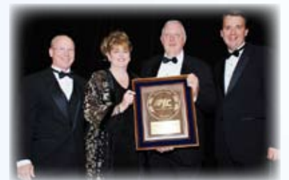
2007 Southern CAL Moving