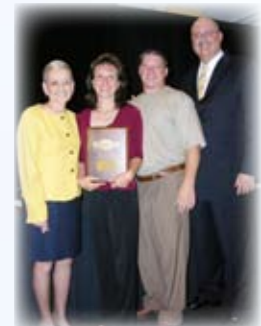
10 YEARS Upright's American Relo Waldorf, Maryland