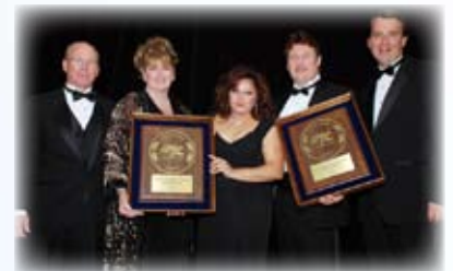
2006 & 2007 Rockey's Moving & Storage Killeen, TX