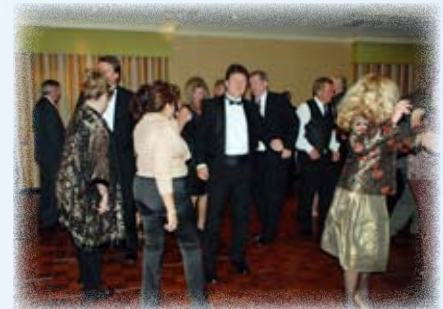
Everyone had a great time!