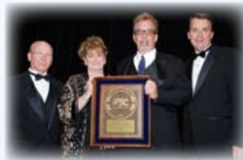
Second Place Customer Service Award Sav-On Moving & Storage