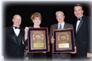
2006 & 2007 Richard's Van & Storage