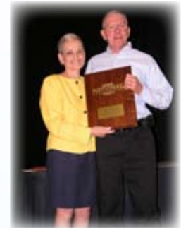
20 YEARS Valley Moving & Storage Mt. Vernon, Washington