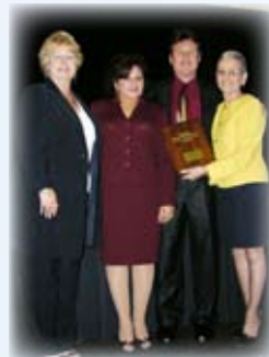
10 YEARS Rockey Van Lines Killeen, Texas