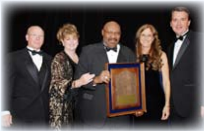
2007 Al's Relocation & Storage