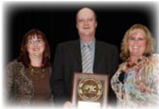
Administrative Excellence 2006 – 1 st Place American Way Van & Storage