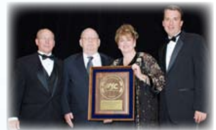
2006 James Movers