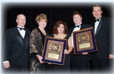
2006 & 2007 Rockey's Moving & Storage San Antonio, TX