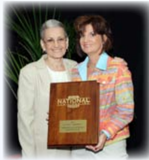
30 YEARS Piedmont Van & Storage Fayetteville, North Carolina