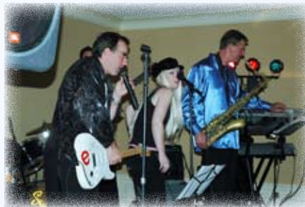
Savoir Faire Band - totally awesome!