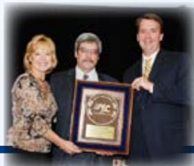
Sales Achievement 2006 – 2 nd Place Transworld Moving Systems